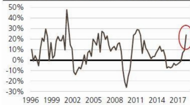
Fig. 3: Capital spending is surging S&P 500 capital spending, year-over-year change

There are some pockets of cost pressures, notably from commodities and wages. Aggregate costs are not rising as fast as revenues and investors remain concerned about negative effects from trade, higher interest rates and rising inflation. In my view there headwinds will dissipate in the coming months.